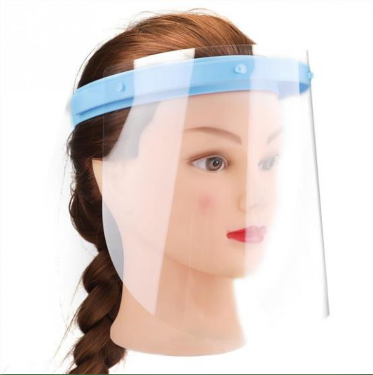
Disposable PET Face Guard